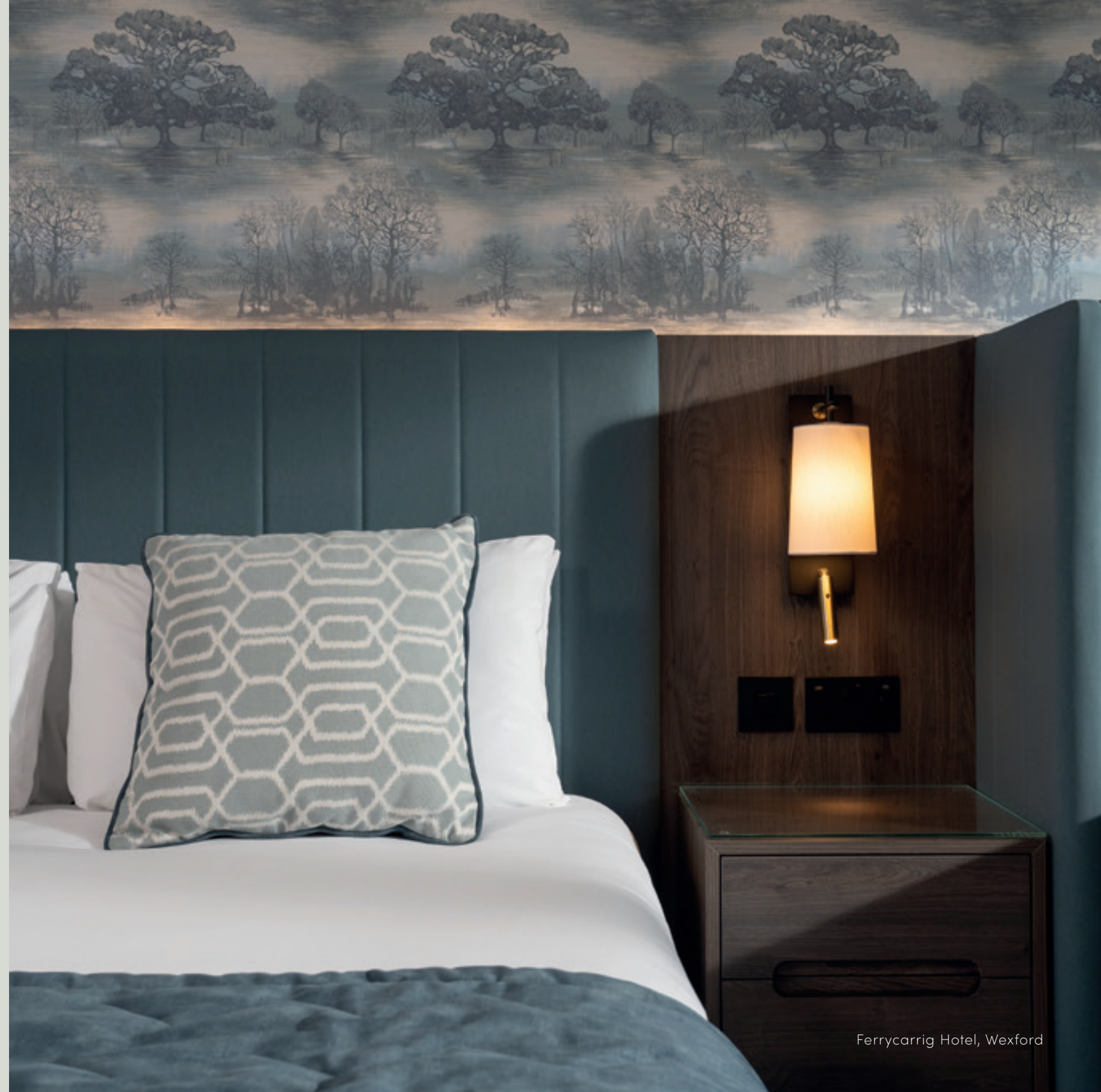
Ferrycarrig Hotel, Wexford

A seamless integration of our design and delivery teams result in high speed, low-risk installation. Our in-house construction professionals use innovative methods to deliver new interiors efficiently and sustainably. Over the years, we have built a reputation for delivering projects with maximum efficiency and with minimal disruption, which has paved the way for GDC Interiors being awarded contracts with some of the most prestigious brands in the global hospitality industry.