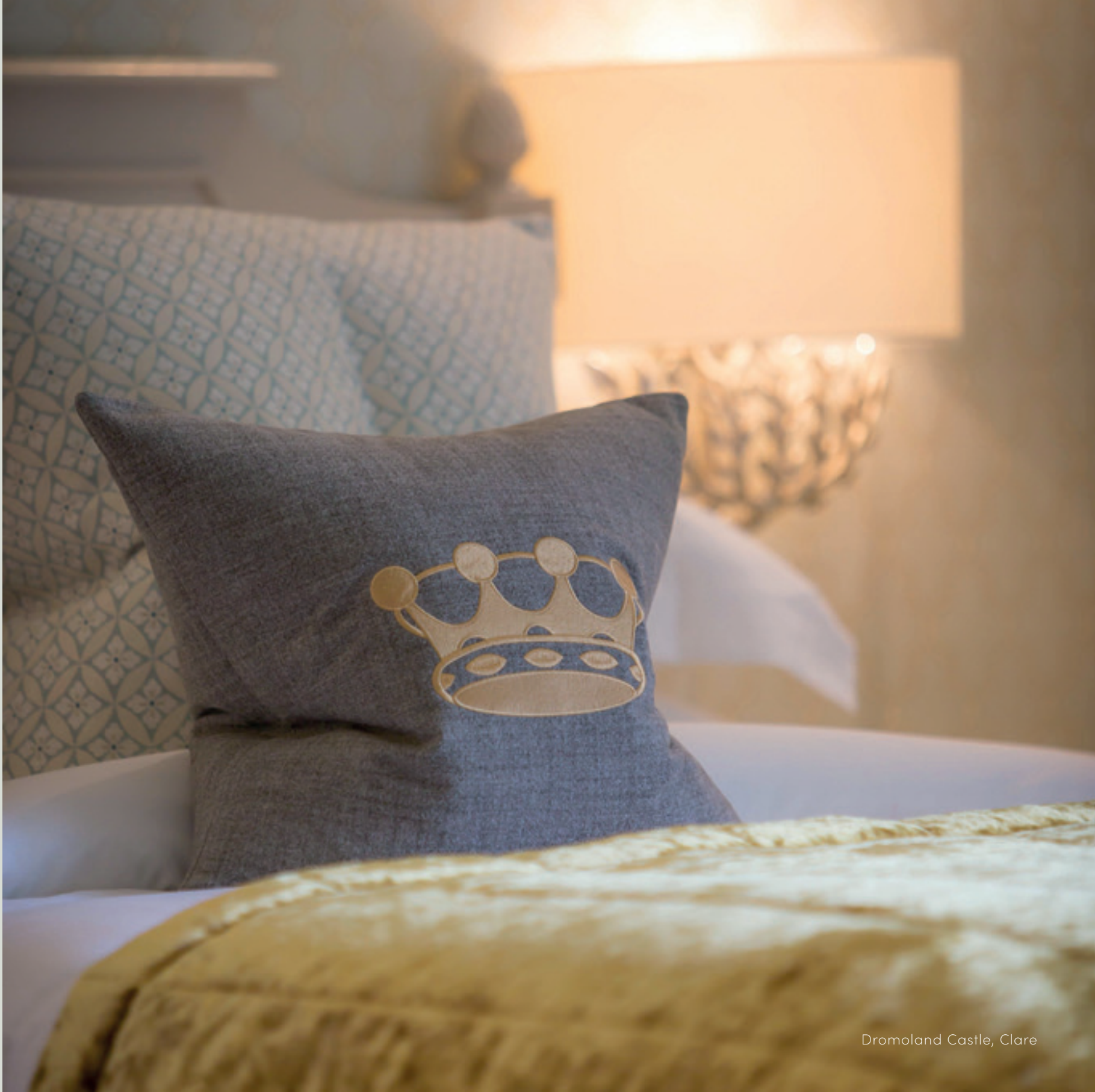
Dromoland Castle, Clare