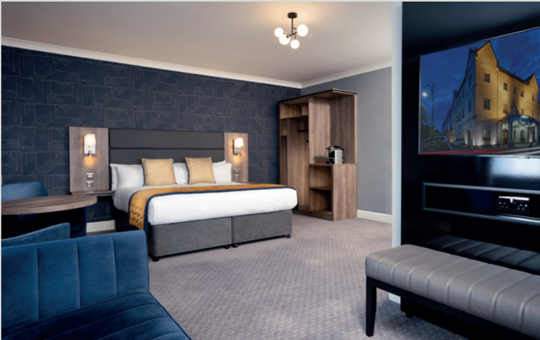
Clybaun Hotel, Galway