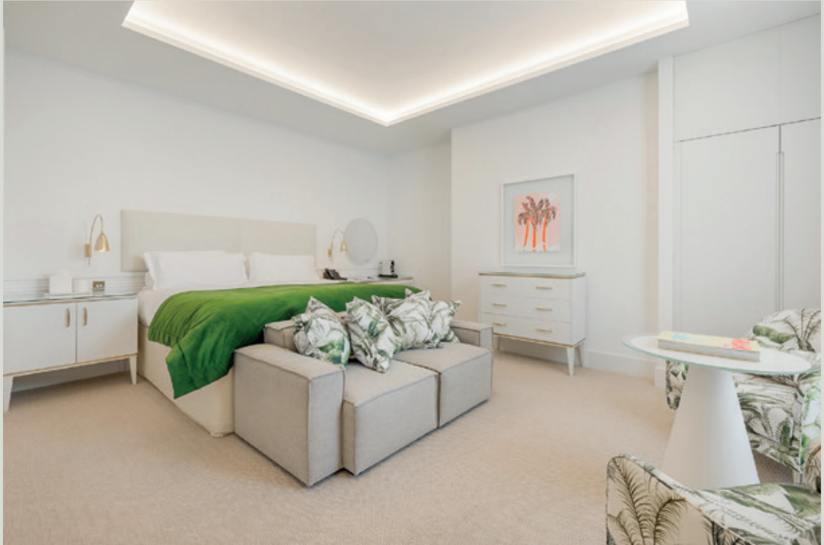
The Nici Hotel, Bournemouth, UK