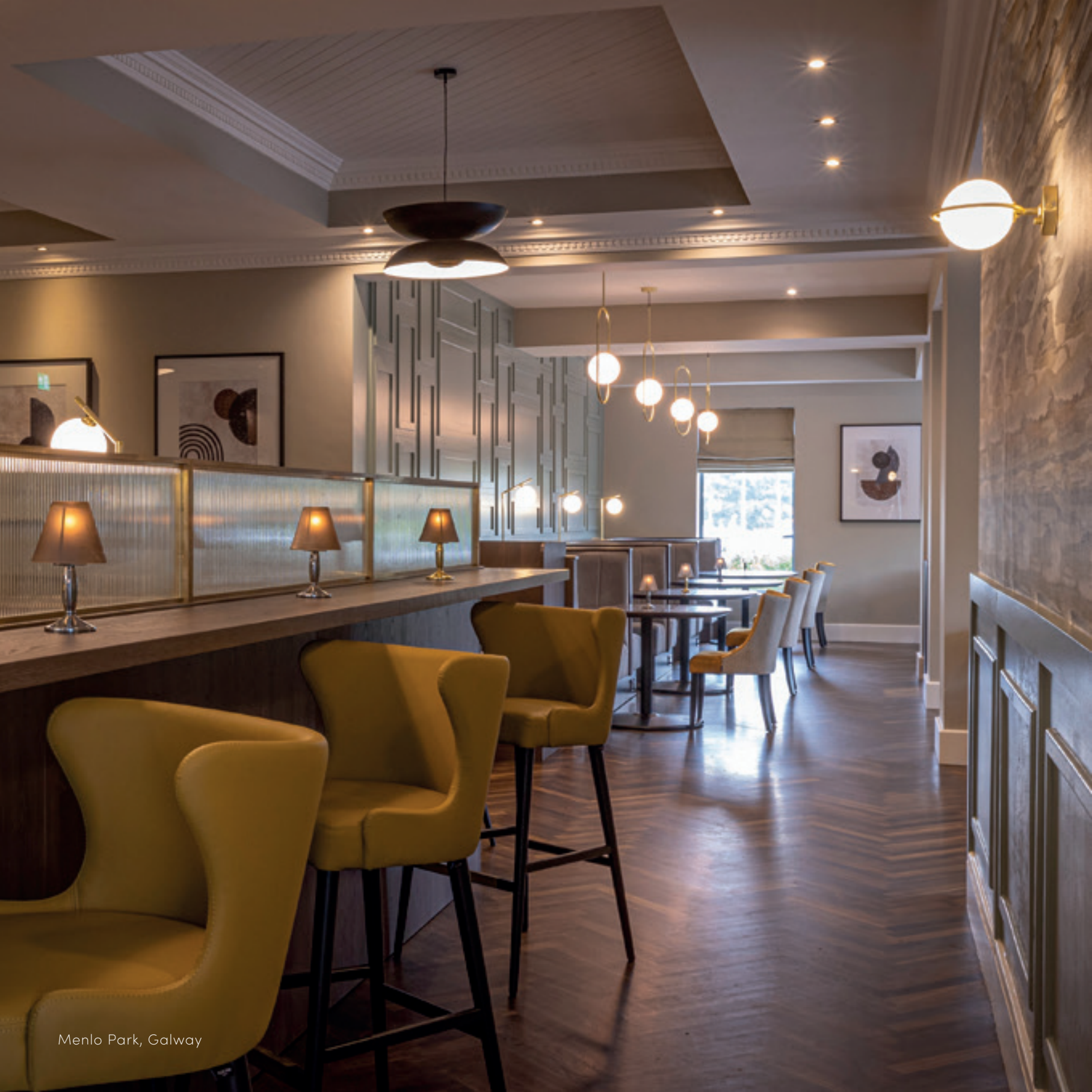
Menlo Park, Galway